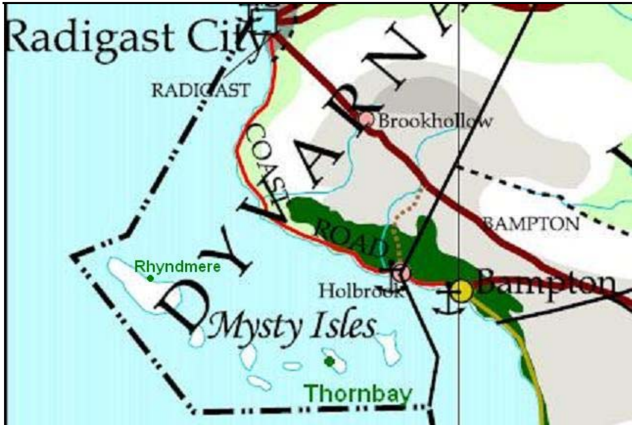
Player's Map 1: The Mysty Isles