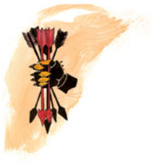
Holy Symbol 1: Symbol of Hextor