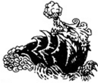
Symbol 1: Xerbo