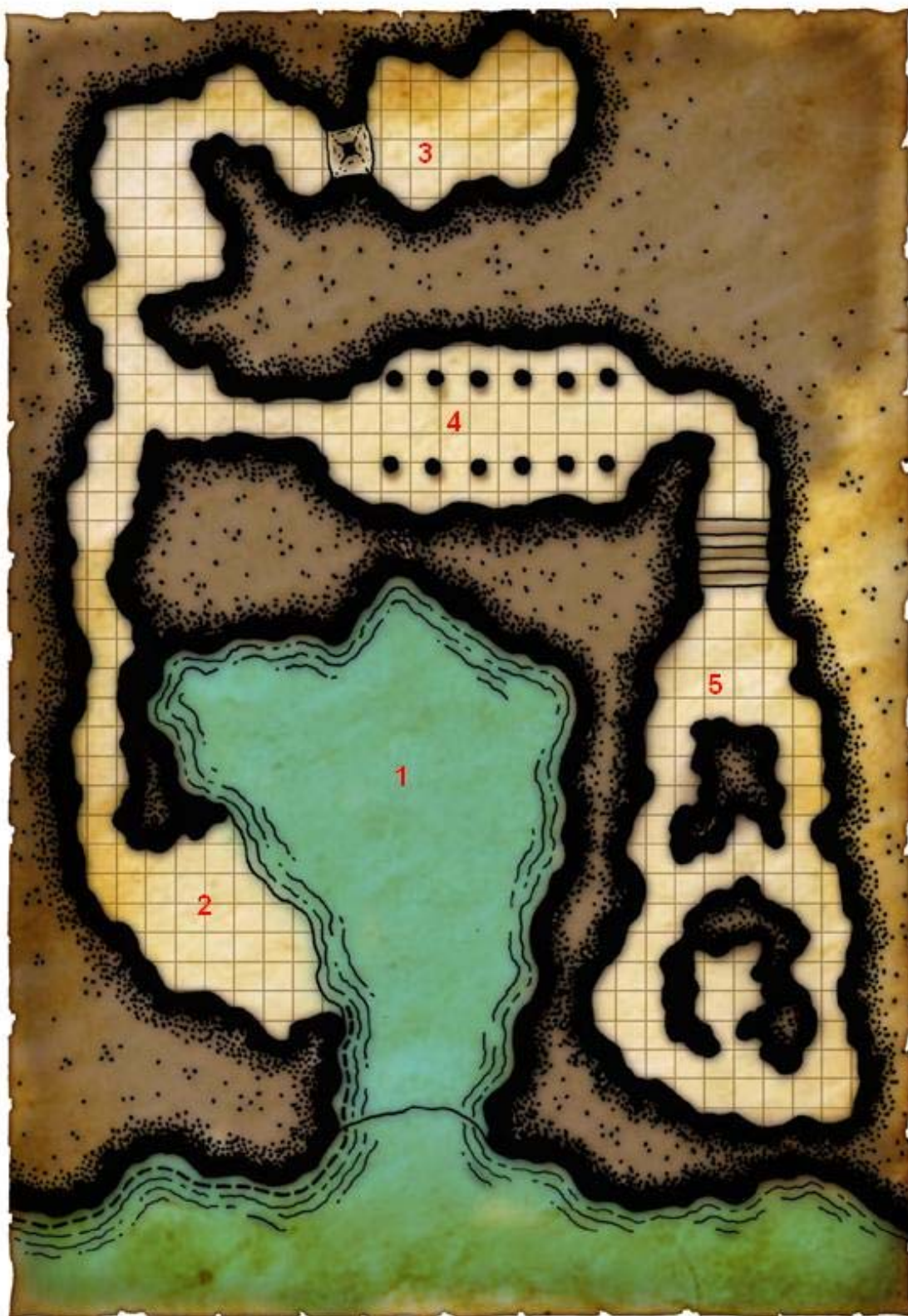
Map 3: Pirate base