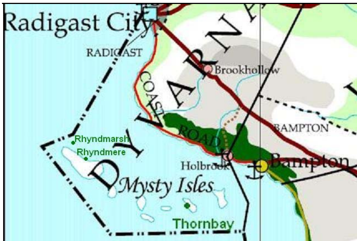
Map 1: The Mysty Isles (DM's Map)