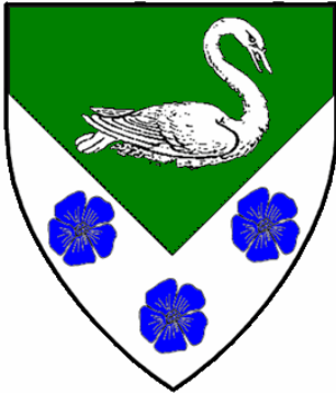
Shield 3: House Gellor