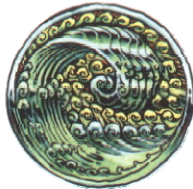
Symbol 2: Procan